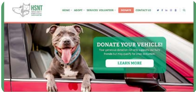
Figure 2. The Humane Society of North Texas homepage shows the organization’s logo, a basic navigational menu, and a photo of a large dog looking out a car window into the camera. Text next to the dog encourages viewers to donate their vehicle in support of the Humane Society.

When searching for “animal shelter,” you receive more than one billion results. You are now faced with a formidable evaluation task, but you can’t possibly look at all of these sources. You could choose to narrow your search terms to something like “animal shelters and lost pets” (which yields 66,200,000 results) or take Google’s apparent suggestion and focus your search on animal shelters in your local area. Let’s say you decide to focus on the Humane Society of North Texas, the first result from your original search (see figure 2).